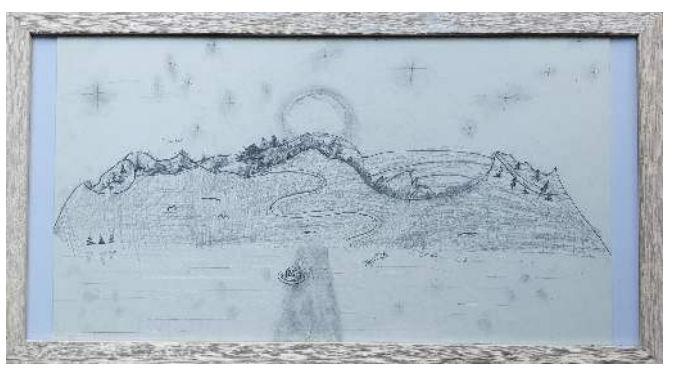
Losey Lochead-Usher - Kilmodan P4/5